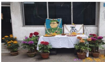
❖ Republic Day Celebration 26 th January,2026